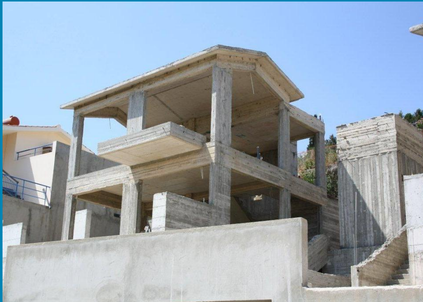
A villa can be completed within a period of 12 months.